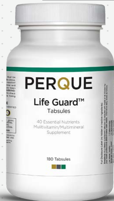
PERQUE Life Guard's Relative Formula Potency Compared to Four "Best of the Best" Brands**

PLACEBO-CONTROLLED PROVEN RESULTS 40 ESSENTIAL NUTRIENTS