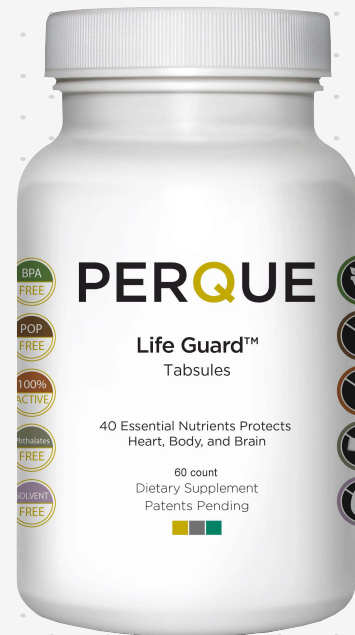
PERQUE Life Guard's Relative Formula Potency Compared to Four "Best of the Best" Brands**

Due to its unique formulation and using only fully active components, PERQUE Life Guard tabsules provide the advantages of capsules and the convenience and enhanced shelf stability of tablets.