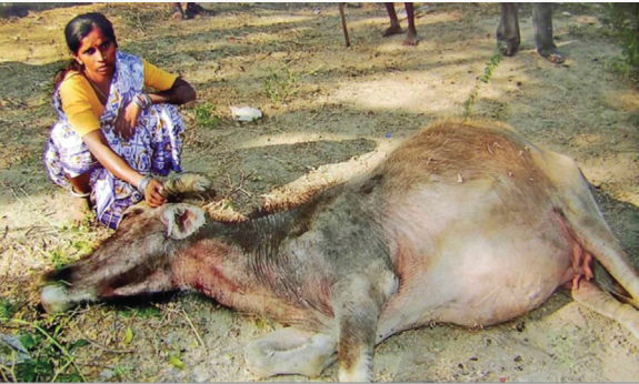
plants after harvest. Others suffered poor health and reproductive problems.

Thousands of Indian buffalo, sheep, and goats died after grazing on Bt cotton