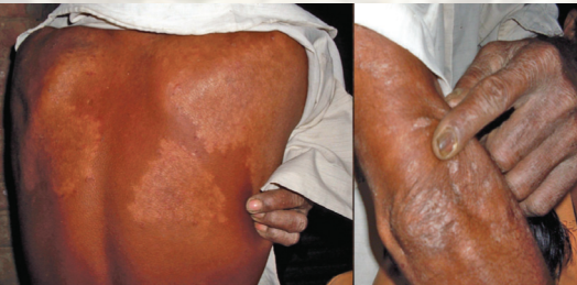
Thousands of Indian farm workers get rashes and reactions from Bt cotton.

Bt-toxin from GM corn can break holes in the membranes of human cells and has been found in the blood of women and fetuses.