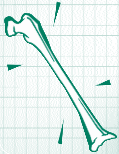
DEXA Scores: PERQUE Bone Guard Forté & the Alkaline Way Enhances Bone Density in Just Two Years